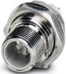
Sensor/Actuator flush-type plug, 4-pos., M12, A-coded, rear/screw mounting with Pg9 thread, with straight solder connection

Please be informed that the data shown in this PDF Document is generated from our Online Catalog. Please find the complete data in the user's documentation. Our General Terms of Use for Downloads are valid ( http://download.phoenixcontact.com )