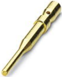
Crimp contact, turned, contact diameter: 1 mm, crimp range: 0.5 mm 2 ... 1 mm 2

Please be informed that the data shown in this PDF Document is generated from our Online Catalog. Please find the complete data in the user's documentation. Our General Terms of Use for Downloads are valid ( http://phoenixcontact.com/download )