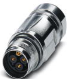
Coupler connector, straight, SPEEDCON locking, M17, Number of positions: 5+3+PE, Type of contact: Socket, Crimp connection, shielded: yes, Cable diameter: 8 mm...10 mm

Please be informed that the data shown in this PDF Document is generated from our Online Catalog. Please find the complete data in the user's documentation. Our General Terms of Use for Downloads are valid ( http://phoenixcontact.com/download )