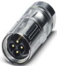
Cable connector, straight, SPEEDCON locking, M17, Number of positions: 5+3+PE, Type of contact: Pin, Crimp connection, shielded: yes, Cable diameter: 8 mm...10 mm

Please be informed that the data shown in this PDF Document is generated from our Online Catalog. Please find the complete data in the user's documentation. Our General Terms of Use for Downloads are valid ( http://phoenixcontact.com/download )