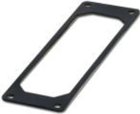
The illustration shows version HC-B 24-FL-DI

Replacement flange seal, for HEAVYCON panel mounting base type D25, self-adhesive, color: Black