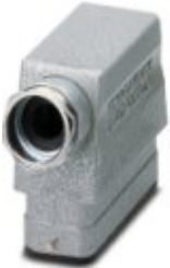
The illustration shows version HC-D 25-TFL-72/M 1 PG 16 S

Sleeve housing, for single locking latch, height 58 mm, without screw connection, 1x Pg16, lateral cable entry