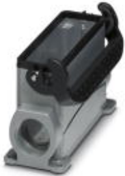
HEAVYCON box mounting base B24, with single locking latch, height 84 mm, with support 1x M32

Please be informed that the data shown in this PDF Document is generated from our Online Catalog. Please find the complete data in the user's documentation. Our General Terms of Use for Downloads are valid ( http://phoenixcontact.com/download )