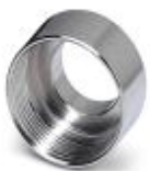
Step-up adapter, M32 to M40, including O-ring

Extension adapter - ENLAR-M-KV-M32/M40 - 1647682