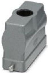
HEAVYCON B24 sleeve housing, for single locking latch, height: 65 mm, with 1 x M25 thread, straight cable outlet

Please be informed that the data shown in this PDF Document is generated from our Online Catalog. Please find the complete data in the user's documentation. Our General Terms of Use for Downloads are valid ( http://phoenixcontact.com/download )