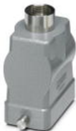
HEAVYCON B16 sleeve housing, for single locking latch, height: 76 mm, with 1 x Pg29 gland, straight cable outlet

Please be informed that the data shown in this PDF Document is generated from our Online Catalog. Please find the complete data in the user's documentation. Our General Terms of Use for Downloads are valid ( http://phoenixcontact.com/download )