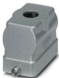
HEAVYCON B10 sleeve housing, for single locking latch, height: 56 mm, with 1 x M25 thread, straight cable outlet

Please be informed that the data shown in this PDF Document is generated from our Online Catalog. Please find the complete data in the user's documentation. Our General Terms of Use for Downloads are valid ( http://phoenixcontact.com/download )