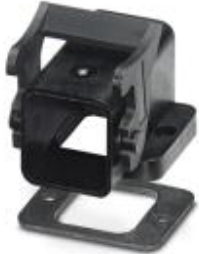
HEAVYCON D7 panel mounting base, with single locking latch, height: 25.5 mm, angled, PA, color: black

Please be informed that the data shown in this PDF Document is generated from our Online Catalog. Please find the complete data in the user's documentation. Our General Terms of Use for Downloads are valid ( http://phoenixcontact.com/download )