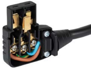
Example with assembled cable